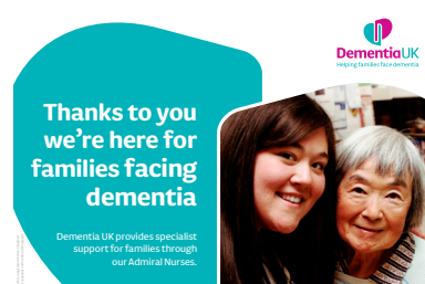
Thanks to you A3 poster