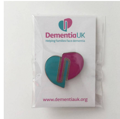
Dementia UK pin badge