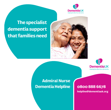
A6 postcards: Dementia UK, Admiral Nurse Dementia Helpline