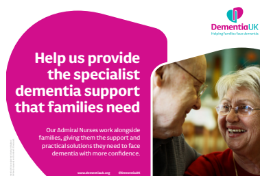
Help us provide specialist support A3 poster