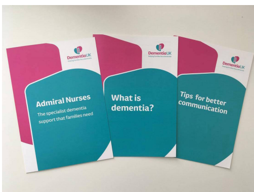
A5 leaflets: Admiral Nursing, What is dementia?, Tips for communication, Getting a Diagnosis, Sources of Support