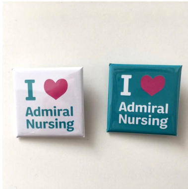
I love Admiral Nursing badges