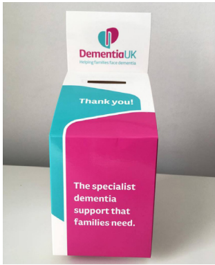
Cardboard collection box