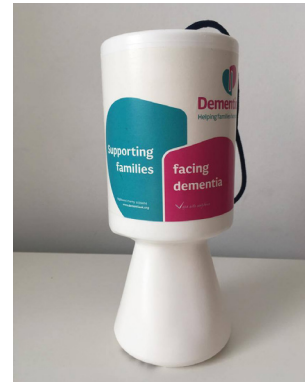
Plastic collection pot